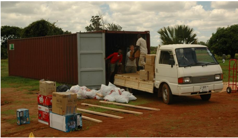
The precious materials inside are being welcomed around the country, as we use them for ministry and discipleship.

Once the Container was cleared by Zambian customs, we were able to begin unpacking the contents. Several days were spent just sorting out the Bibles, school materials, what belonged to ourselves, and the items of the missions who split the shipping with us. We were able to bring our own household items back to Kabwe, ending our days of “camping it out”, which made us all very happy and much more comfortable! There’s something about having your own plates and your own sheets that makes life just a little bit nicer. God has indeed been gracious in providing the means for us to have these treasured items from the USA. As soon as the boxes were sorted and replaced in the Container for storage, we were able to begin distributing the literature and school supplies.