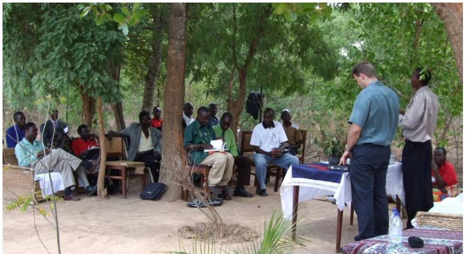
A group of pastors in rural Chongwe, eager to learn from God’s Word.

The Hand of God was truly with us, and on the Container, throughout this whole process. In many ways, the Container Project never should have happened. From the colossal amount of materials needed to fill it, to the funds needed to ship it, to the difficulties involved in bringing it into the country, this was a daunting project from the beginning. However, the Lord showed us every step of the way that this was HIS project and He, of course, had everything under control. Often our needs, such as donations of Bibles and books, funding, even a place to store and sort the materials