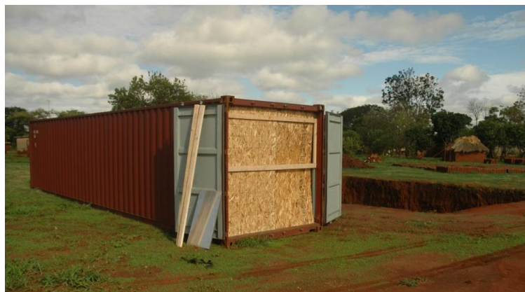
We were grateful to see the Container finally in Zambia! It is being stored at the Flying Mission Base near Lusaka.