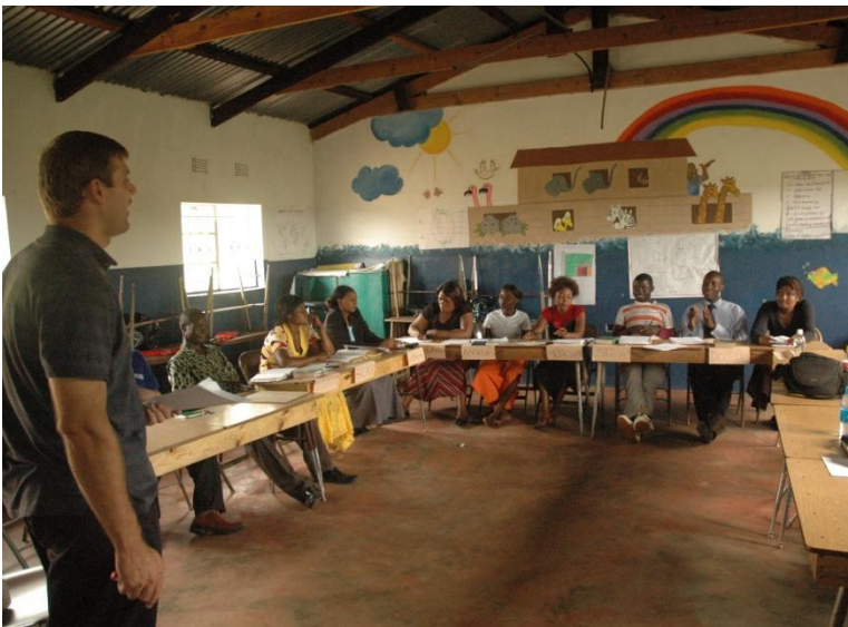
Ministering to teachers in Mufulira

"Brothers, pray for us that the message of the Lord may spread rapidly and be honored, just as it was with you. And pray that we may be delivered from wicked and evil men, for not everyone has faith." II Thessalonians 3:1-2