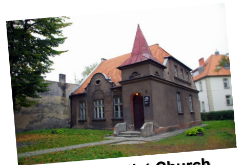
Kalisz Baptist Church