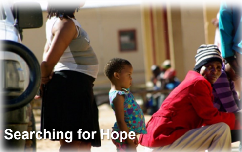
Searching for Hope