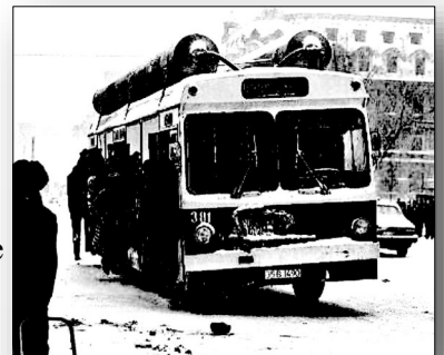
Typical overloaded transportation in Communist Romania.

friends in America, who were very concerned about the ill-treatment of their Brothers in Romania. He persuaded the CMO that Romanian Baptist could be regarded as 'the goose that laid the golden egg' as far as obtaining high tech medical items and other goodies from