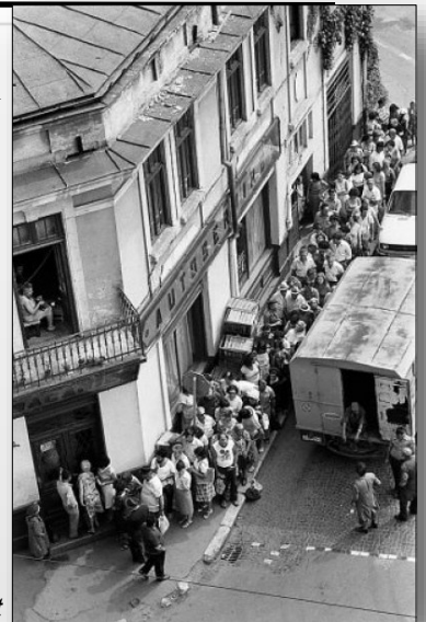
A man who photographed a similar line at a local butcher shop was imprisoned for 6 years. (Pandele 1980s)