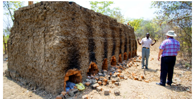
God provided good clay soil so Ruben could make his own building bricks.