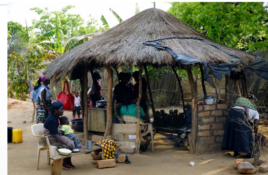
Ladies of the Church prepare mid day dinner for the ITMI team in their humble church kitchen.