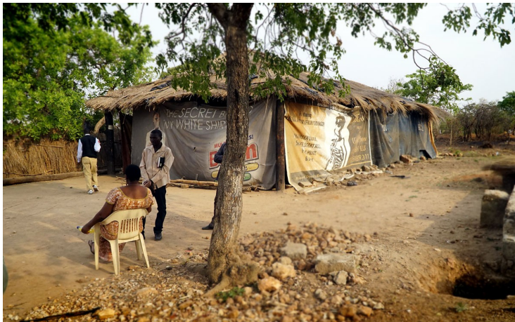
Reconciliation Ministries International Church, Katakantapa, Zambia. Warm and gracious welcome to all visitors.