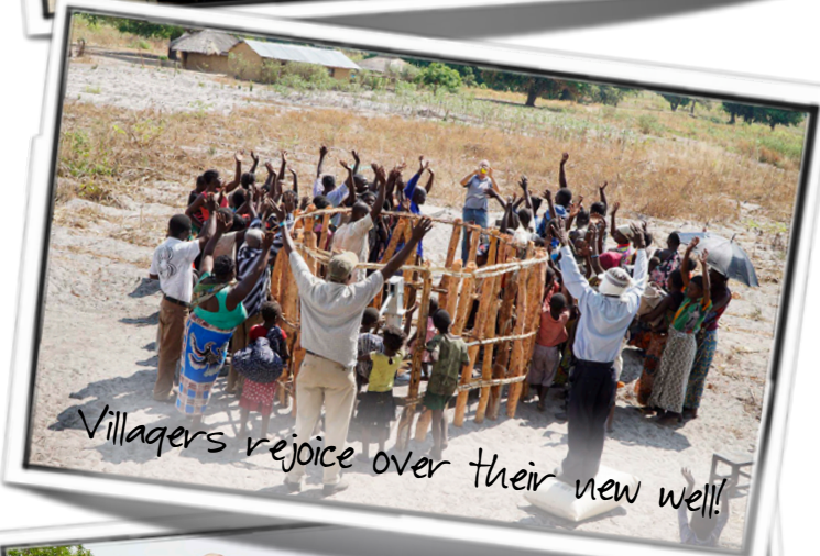
Villagers rejoice over their new well!