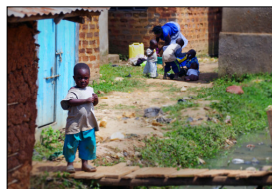
Naomi's heart is to reach the needy