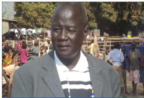
Children scrambling for food under watchful eye of camp official

Jahim's plan was hijacked. He did get to the border, but when he arrived, he was confronted, while still in Uganda, with a South Sudanese refugee camp. The internal pull and God provided opportunity to give back to those 20,000 plus souls that are so alone and