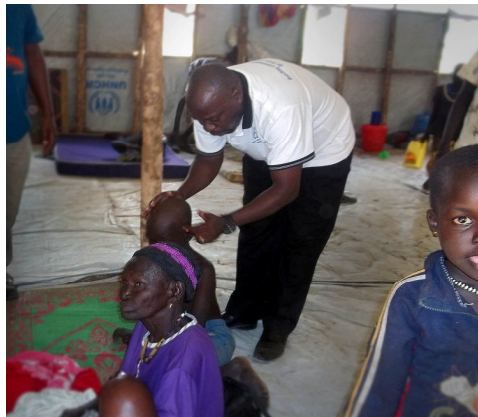
Praying for the sick

and pray for them, and then we took our time to pray for those who are sick."