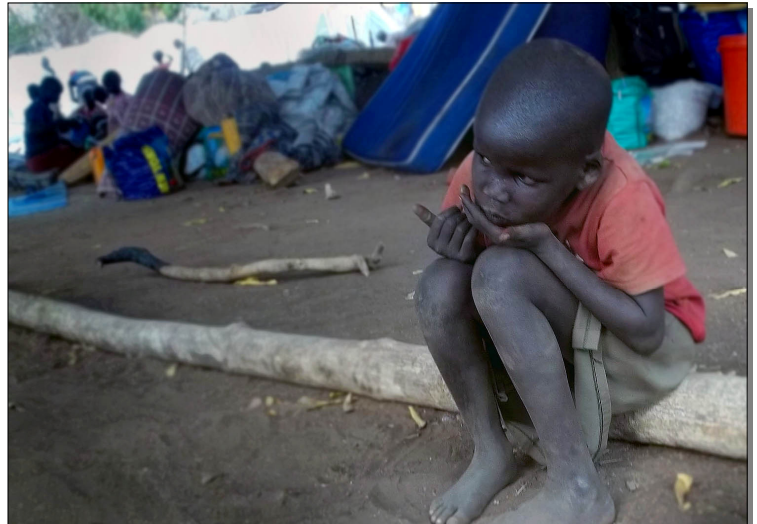
Fatherless and Motherless child left to himself in refuge camp

The capital city of Juba where Jahim lives and bases his ministry was in complete disarray. The pent up bitterness between different tribes and its effect of unleashing all old "offences" between even neighbors, caused an anti-Christmas spirit to be released with a vengeance on hundreds of thousands who just happen to be living in its way. And the unabated violence was splattering its ugly self in colors of red, pain and death. Jahim shares that Juba