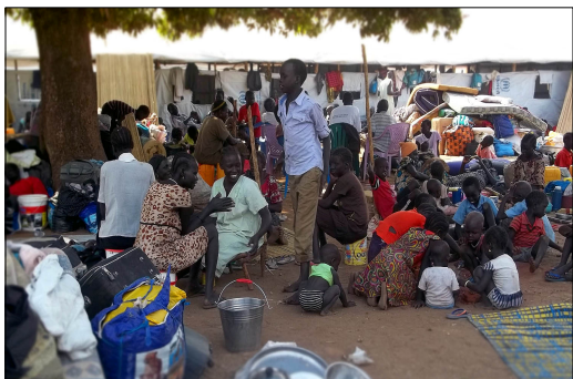
Refugees living under a mango tree at Uganda-South Sudan border

"Many of them are sick, we [were] so helpless, what we did is to gather few of them to encourage them with the Word of God