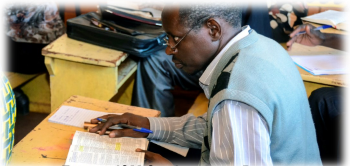
Former ISM Student, now Pastor