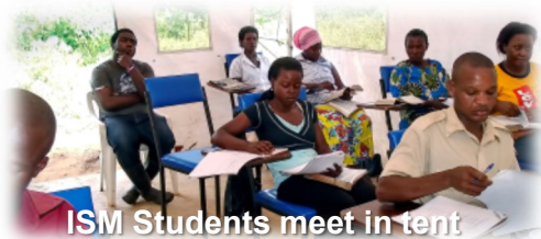
ISM Students meet in tent

nations, baptizing them in the name of the Father and of the Son and of the Holy Spirit” (Matthew 28:19).