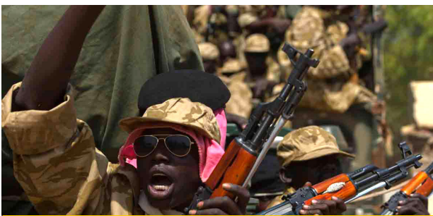
Tribal Conflicts Boil Over

What Timothy didn't verbalize specifically, but clearly knows to be true is this - if the anger and bitterness in the hearts of the South Su-