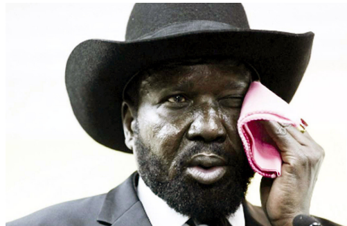
President Salva Kiir