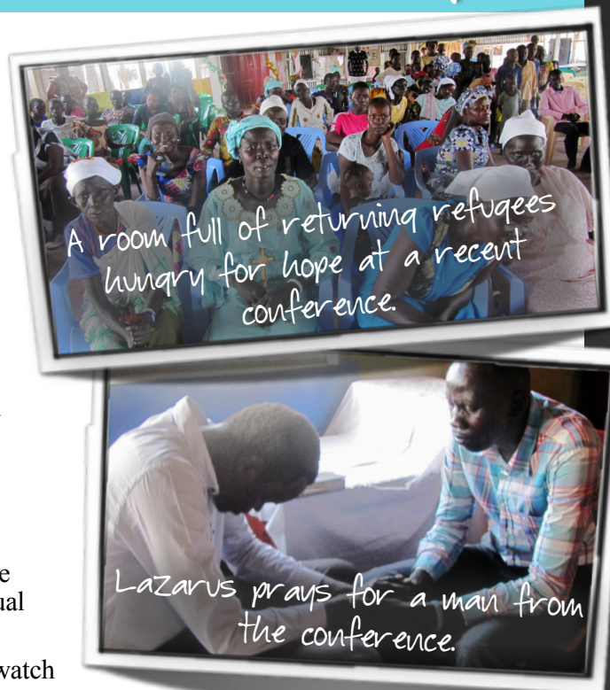
A room full of returning refugees hungry for hope at a recent conference.

But the hopeless circumstances they faced after returning to their home in Bor, South Sudan drove local men to cast aside cultural norms and come anyway.