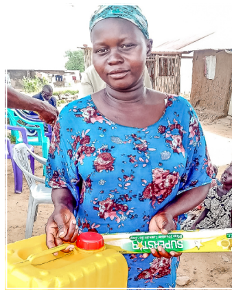
Recipient with soap and water jug.