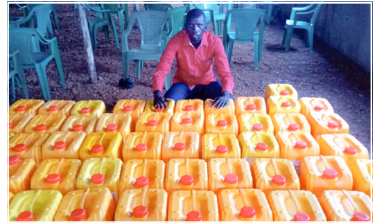
Lazarus with water jugs

Two ITMI donors provided $500 to purchase 50 jerry cans for South Sudanese families. However, by the time Lazarus had the money in hand, the total cost had risen substantially. After paying the bank fee, Lazarus could only purchase approximately 38.5 of the 50 jerry cans