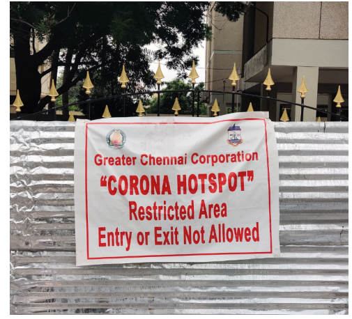
A virus hotspot in an Indian city, closed off by authorities.