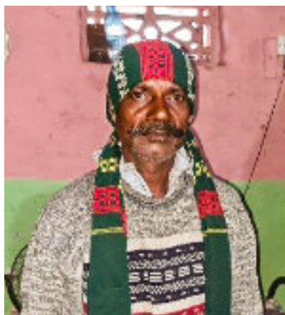
A resident of Ambedkar slum who is struggling with health issues.