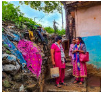
Taru and her team plan the future distribution.