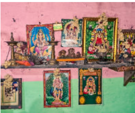
Shrines to Hindu gods and goddesses inside one of the homes.