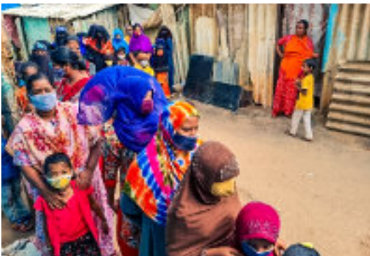
Modi Road slum families queuing for food parcels.