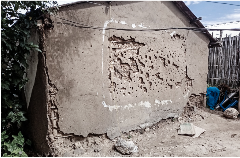
The walls of the room where the children sleep are melting away. The structure needs to be rebuilt.

now much larger than it was when the structure was built.