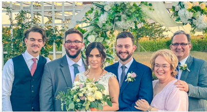
The Ban Family, Romania