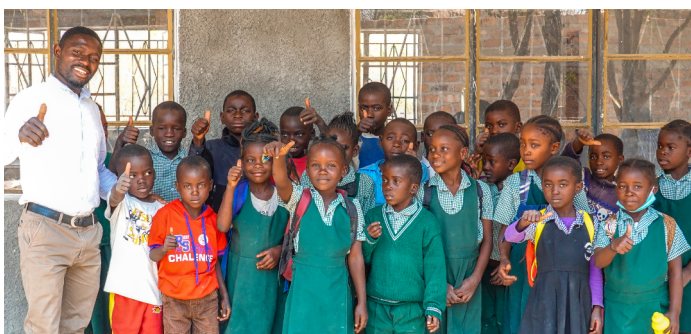
"I am filled with joy to see my children...pray in a way they did not pray before I met them."