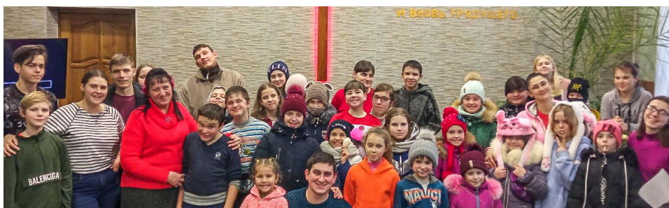
Campers and leaders gather for a group photo.