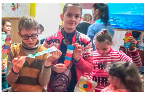
Campers proudly display crafts