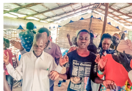
After Lazarus taught, many stepped forward to give their lives to Jesus!

After Lazarus taught, many stepped forward to give their lives to Him!