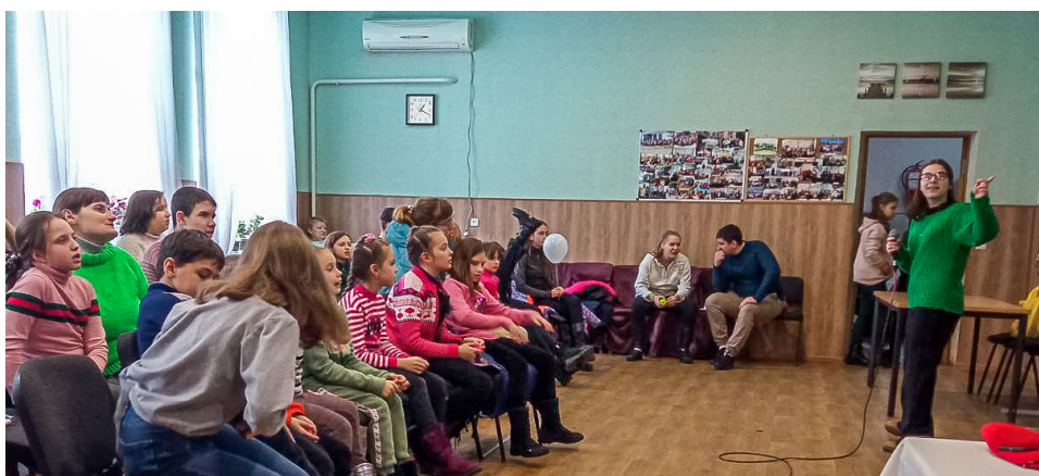
Campers listening to camp teaching in eastern Ukraine.