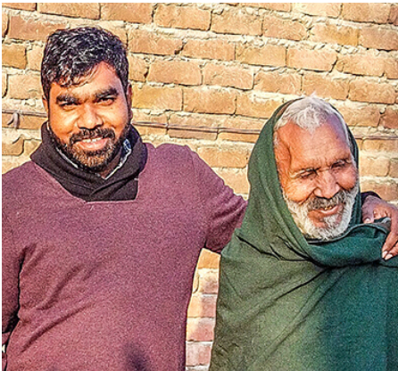
One elderly man stated, "We have not seen such care from anyone else."