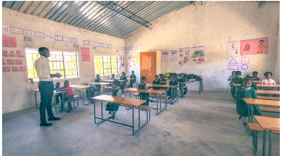
Above: Spring of Love Christian School is a remote village school in Zambia.

Once they can move into onsite housing, the teachers are eager to become even more involved with the lives of the villagers. They have plans for after school outreaches and programs that will improve the lives of the people in the village as well as reinforcing the Biblical principles that are being taught during the regular