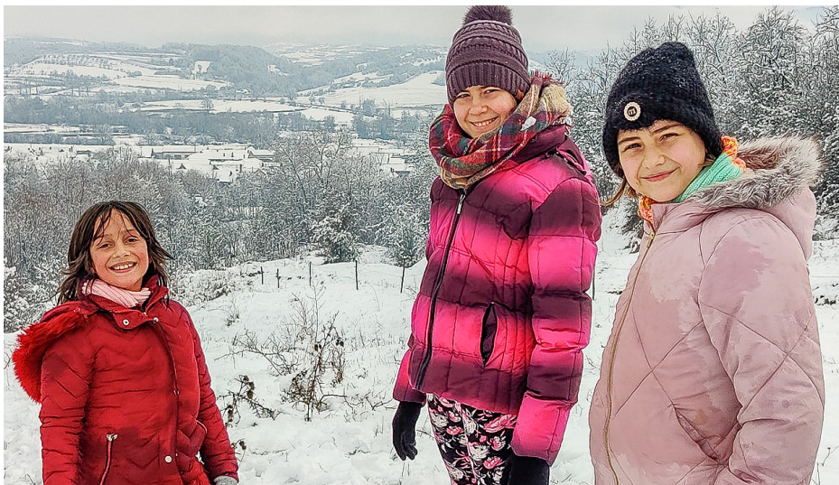
Above: Casa Dorca girls thrive during Romanian winter because their home is warm and safe.