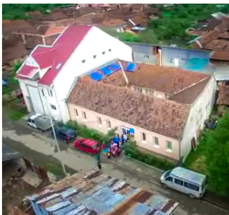
Casa Dorca Children's Home in Rural Romania.