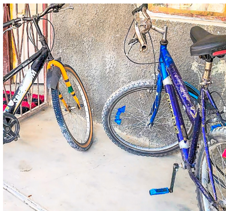
Spring of Love teachers ride dilapidated bicycles ~5 miles each way every day to get to school.