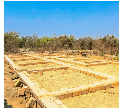
The foundation for the onsite teacher housing building has been laid.