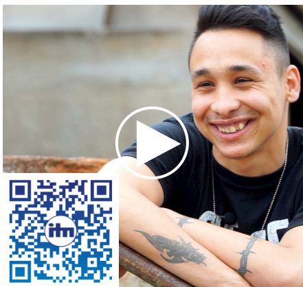
Scan here to meet Casa Dorca alumni and hear their stories on video!