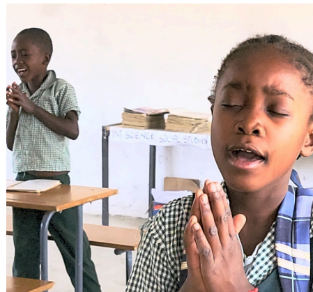
Spring of Love students pray before leaving for the day.