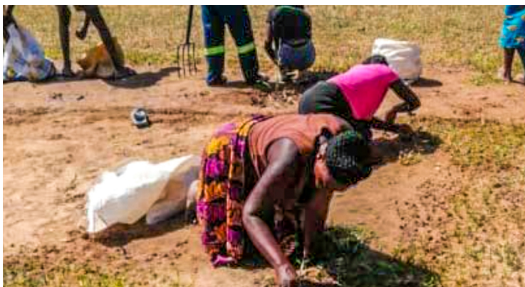
Every Thursday, a group of young widows volunteers at the mission. On this day, they were working to plant grass.