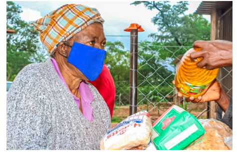
An elderly widow receives a food parcel.

Cozmore can make use of your partnership in any amount, and he