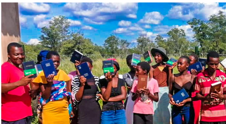
Cozmore with youth from Gwayi River, Zimbabwe after volunteering at Cozmore's Mission base in exchange for their own copy of the Bible.