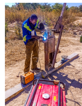
Fixing the brick-making machine.