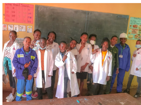
Career Day at Spring of Love Academy!