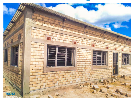
The on-site teacher housing building with walls and a roof!