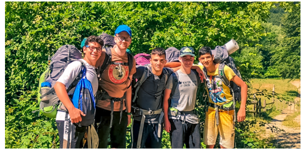
A group of boys from Casa Dorca enjoy a wilderness camping trip this summer.

helps transform the lives of hurting and broken young people.