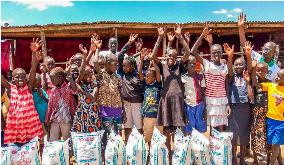
Orphans reached with food, the Gospel and discipleship opportunities through ITMI's Project Joseph in South Sudan.