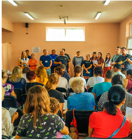
Refugees attend a service at the help center.