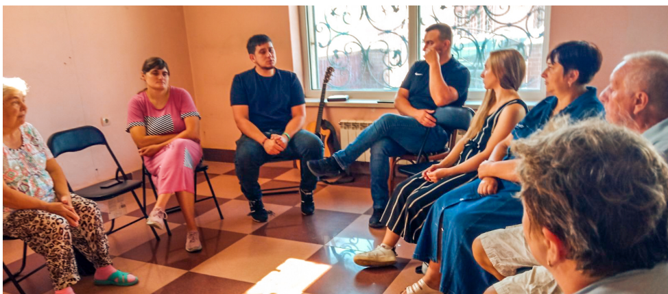
Ukrainian refugees meet to study the Bible after receiving help at the Christian help center.