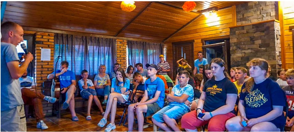
Youth and children at camp encouraged in and reached for Christ, despite martial law, fear and sirens.