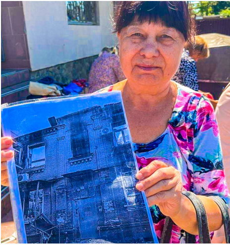
A woman who received help at the center.