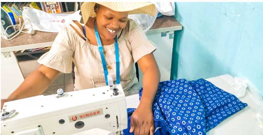
A resident of the informal settlement of Stone Hill, South Africa learning to sew using machines provided by ITMI supporters.