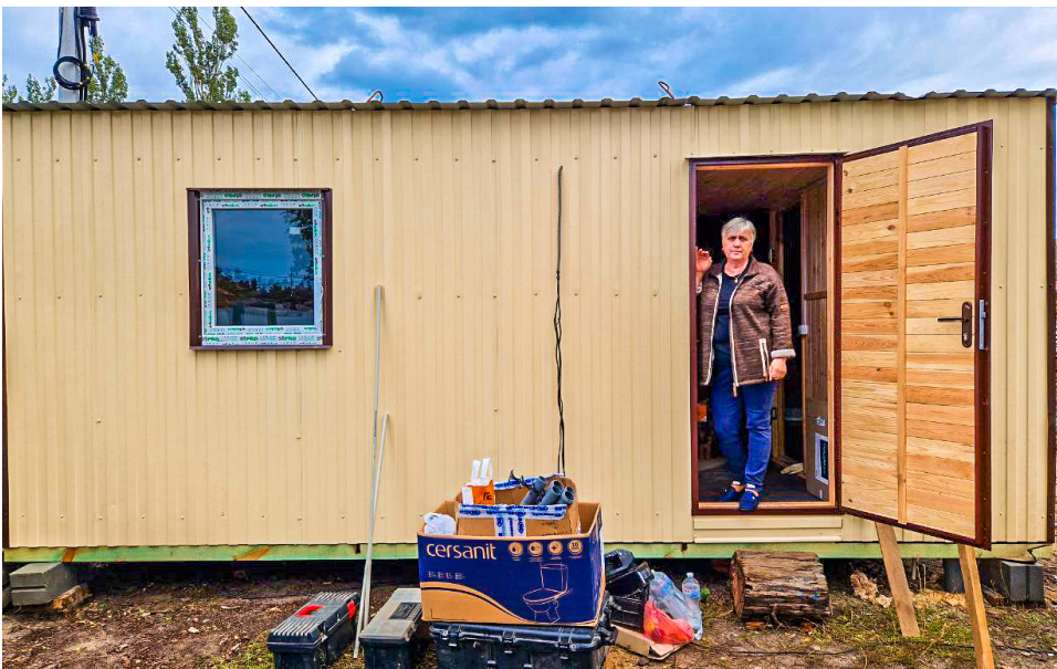
Tiny modular homes built for Ukrainians in Kyiv region whose village was destroyed by a Russian bomb.