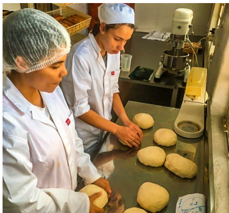
Two of the le Roux's daughters prepare loaves of bread.