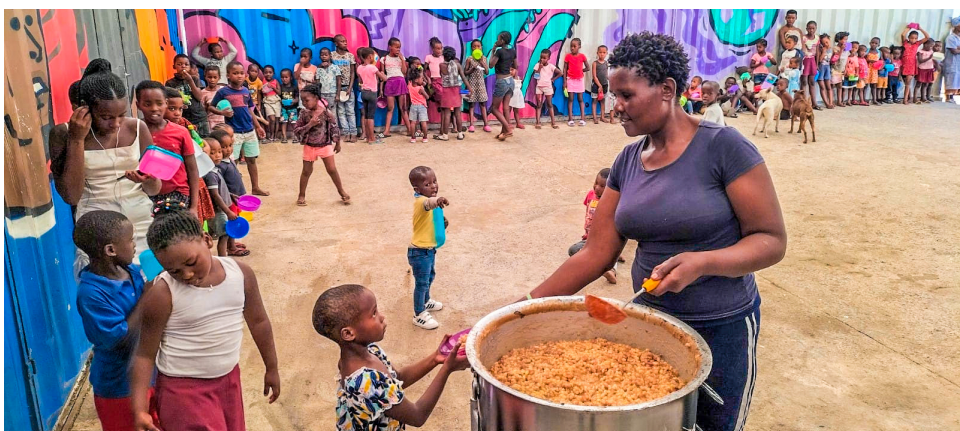
Youth and children in Stone Hill wait to receive food through the daily food outreach.