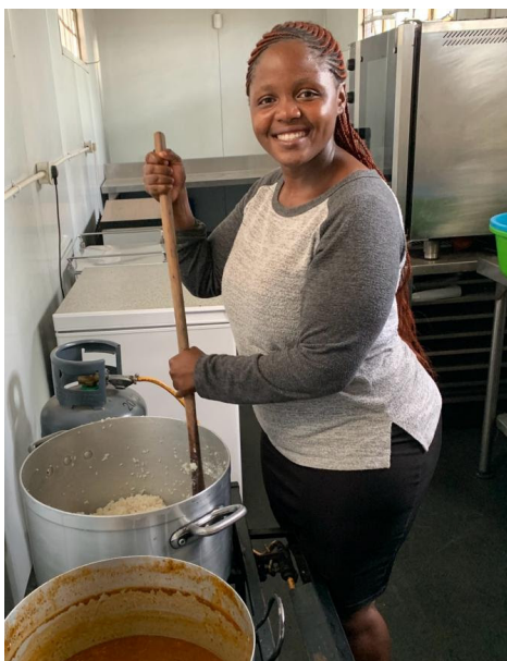
Feeding all those children is a lot of work and requires a big pot!