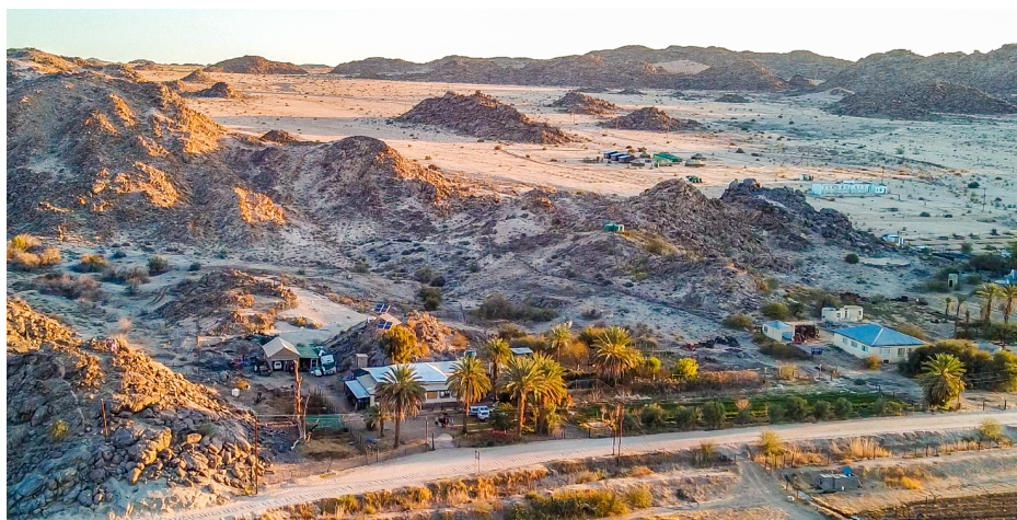
Onseepkans Mission is a remote property near a remote farming settlement in the Northern Cape area.