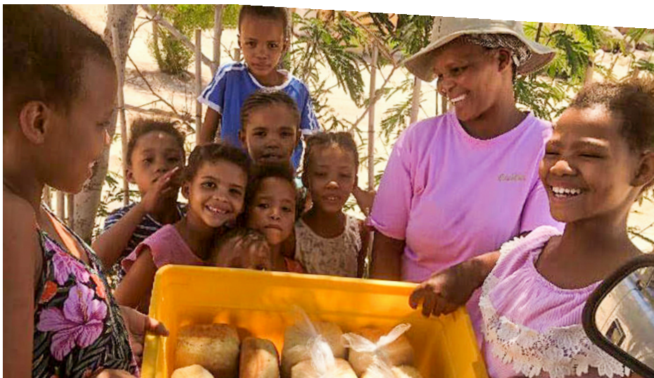
A family receiving the blessing of a delivery of bread from the le Roux's bakery.