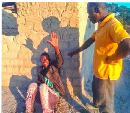
A villager, once known for drinking and fornicating gives his life to Jesus.