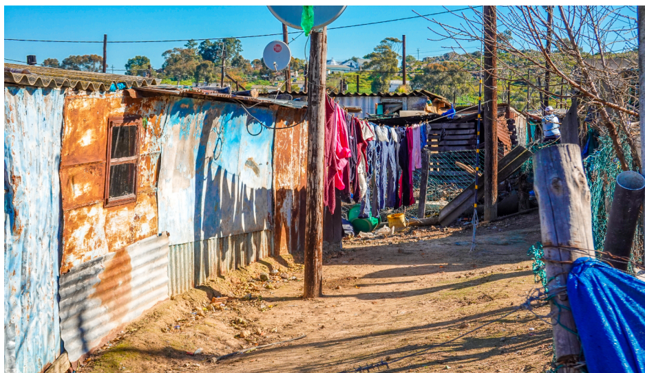
Family homes in Stone Hill made of corrugated metal and other scrap materials.