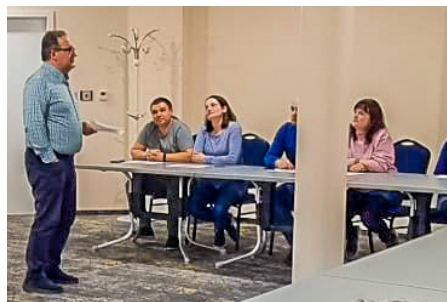
Adi encouraging pastors from Ukraine and their wives.

wife shared, pulling back the curtain to reveal just one of the many ways these brothers and sisters have lived under pressure for over a year. These pressures