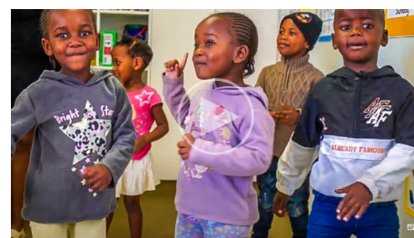
See the ministry your support helps make possible in these clips from recent outreaches!