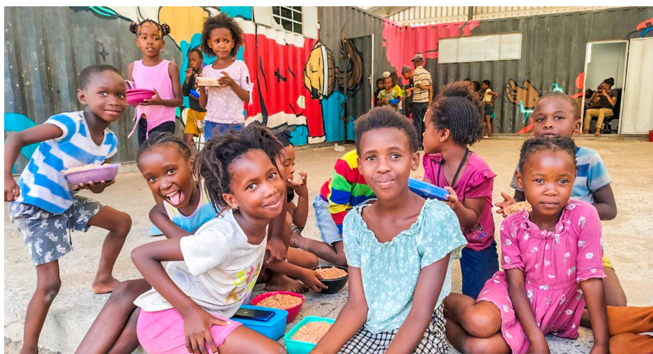
Stone Hill children enjoy a nutritious meal at the community center.

Videos from Stone Hill! Watch at intouchmission.org/stonehill