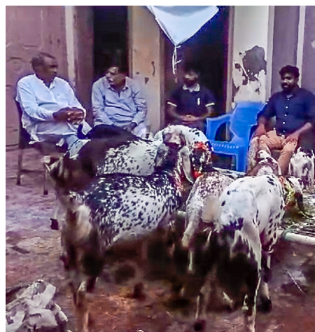
In the waning light of the day, some men from the community gather in Abid's courtyard.