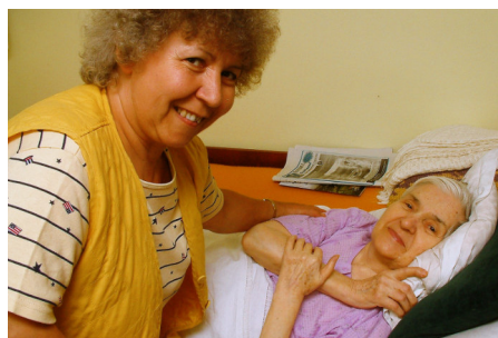
Simple kindness in a quiet room—seen by God, remembered in eternity.

her with scoliosis. She dreamed of becoming a teacher, or maybe a musician. Rejected from both paths, she trained in medical