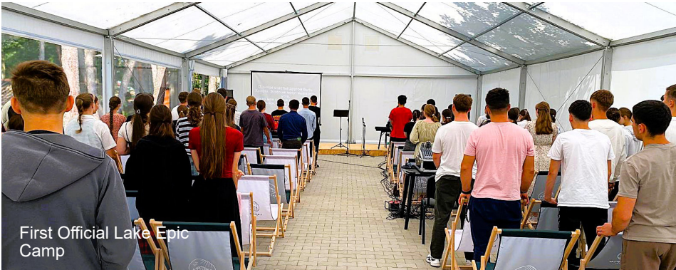
First Official Lake Epic Camp