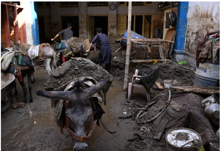
Beasts of burden carry away the residual contaminated mud one shovel at a time

This is not just flood relief. It is a Kingdom opportunity.