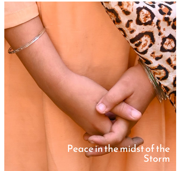
Peace in the midst of the Storm