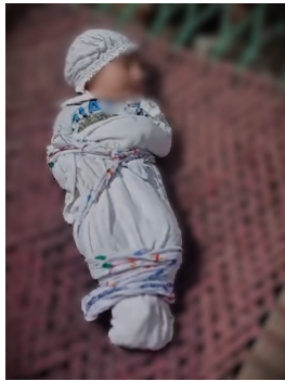
Infant in burial cloths