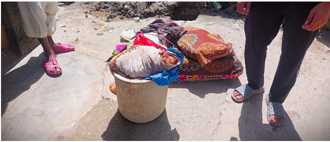
Complete earthly possessions in a bucket.

When aid is delivered in Jesus' name, something remarkable happens. It is not only survival—it is testimony. In Islamabad, families who had drifted from the faith recommitted their lives to Christ. Children smiled again after days of fear and hunger. One widow, abandoned and forgotten, felt seen by God. The same can happen in the Swat Valley, a place long considered unreachable, hard, and closed. What decades of persecution have tried to silence, the compassion of Christ can proclaim. By stepping into this moment of devastation, the church has the chance to rise above generations of oppression and show the watching world that God's people love all men—Christian and Muslim alike.