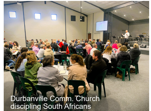
Durbanville Comm. Church discipling South Africans