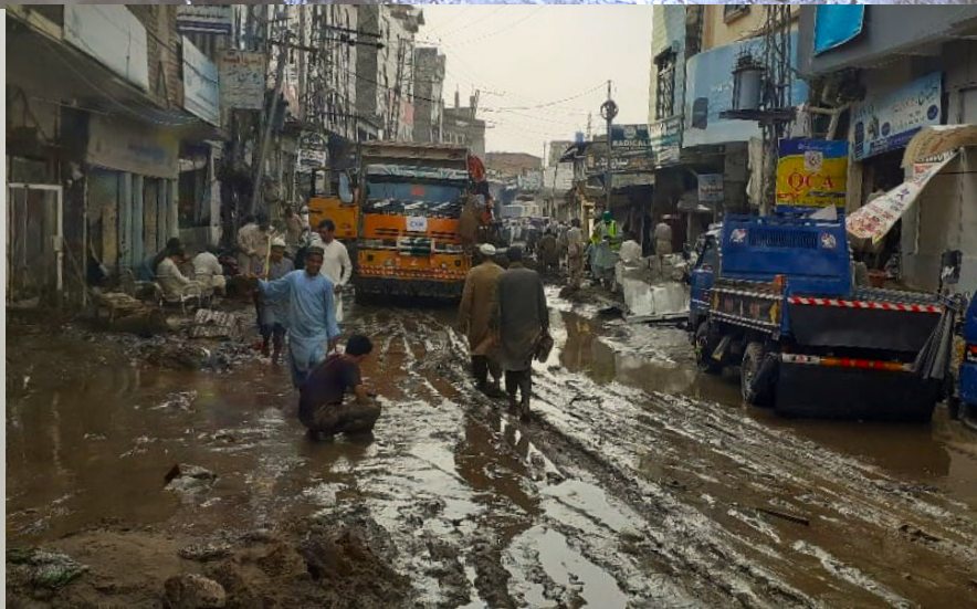
Swat Valley: Floods in Pakistan